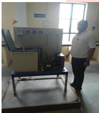
Fig2 VAPOUR COMPRESSION REFRIGERATION REFRIGERATION SYSTEM TEST RIG

Vapour compression test rig is available at mechanical engineering department of RKDF University Bhopal Madhya Pradesh. This experimental set up is used as a waste heat of condenser is useful for water heating purpose for domestic application example like bathing, dish washing in Kitchen. A separate water tank is used for